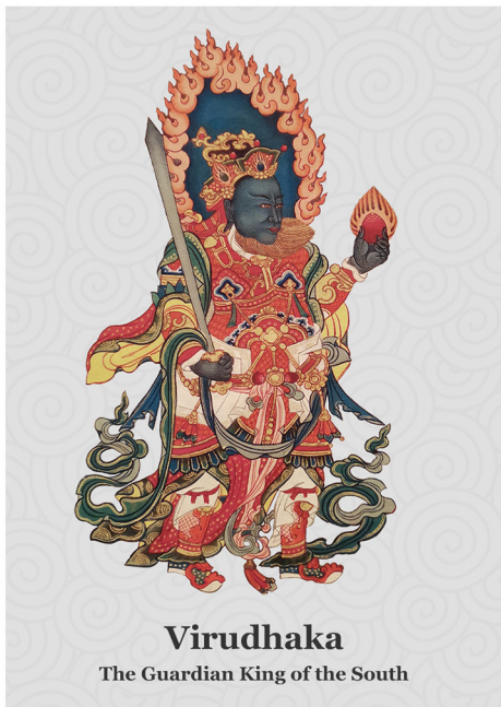
Virudhaka The Guardian King of the South