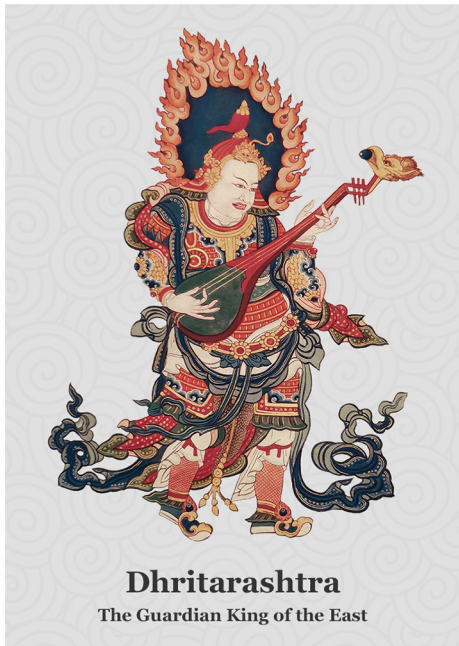
Dhritarashtra The Guardian King of the East