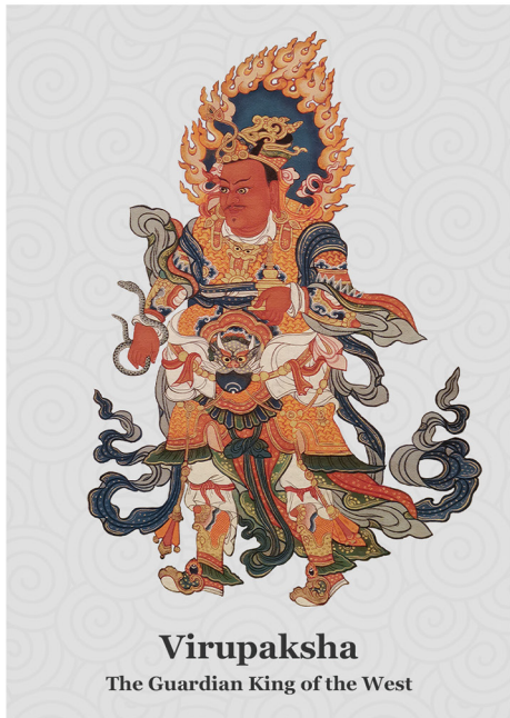
Virupaksha The Guardian King of the West