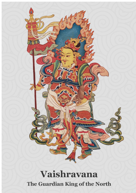
Vaishravana The Guardian King of the North